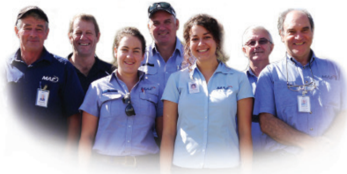
Some of the New Zealand staff currently serving overseas who are passionate about missions and aviation.